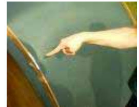
Inspect for Rips