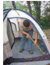
Clean the tent