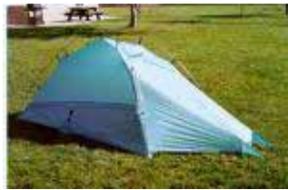
or Dry by setting up