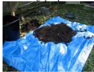
Dirty, unfolded 😞