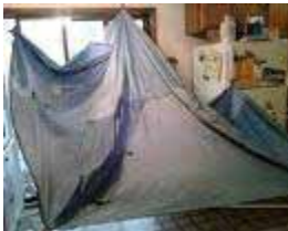
Dry by Hanging