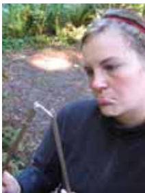
Check for Broken Poles